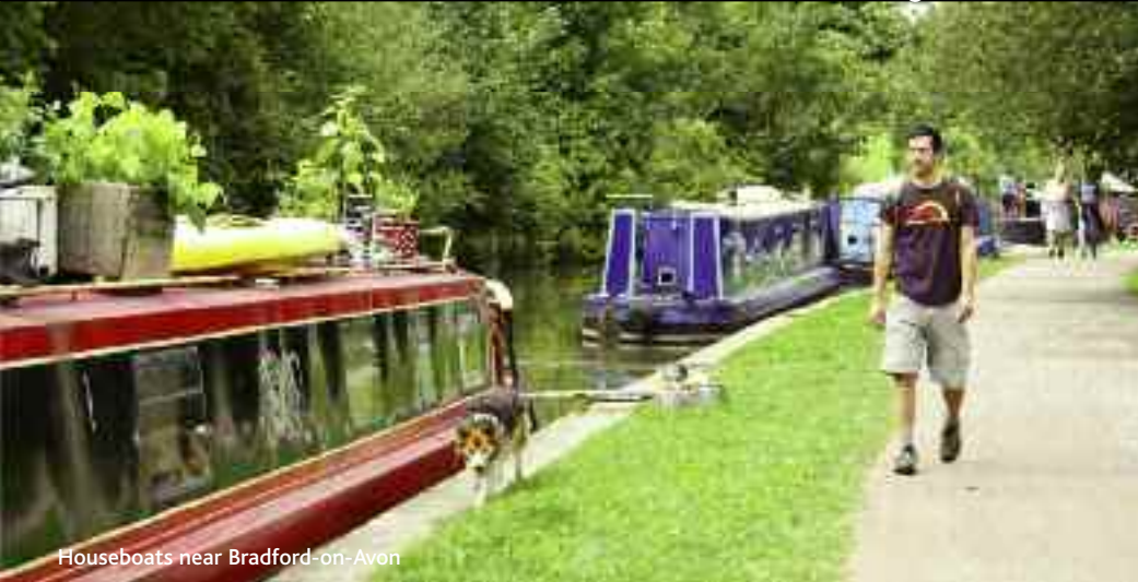
Houseboats near Bradford-on-Avon