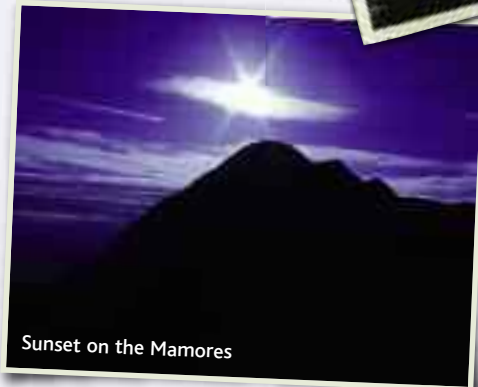
Sunset on the Mamores