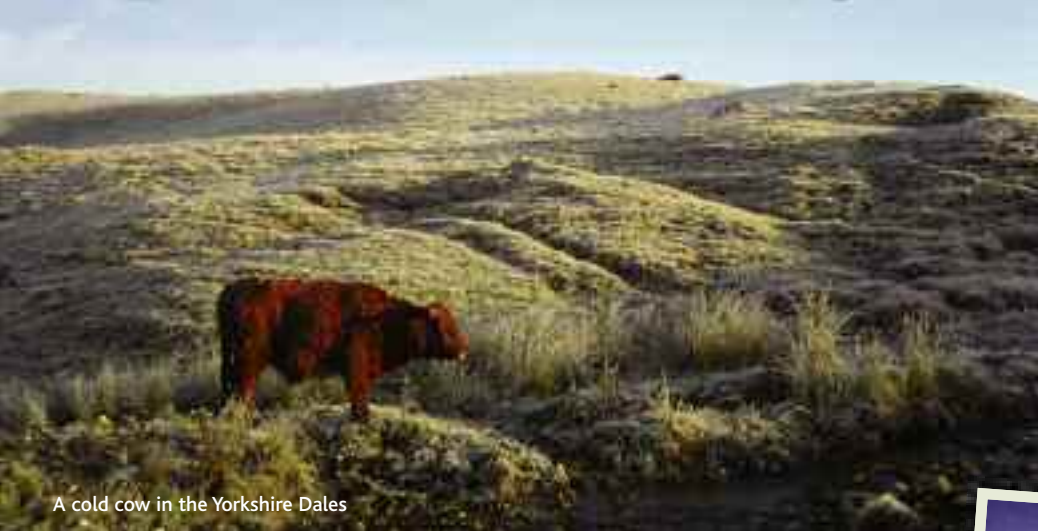
A cold cow in the Yorkshire Dales